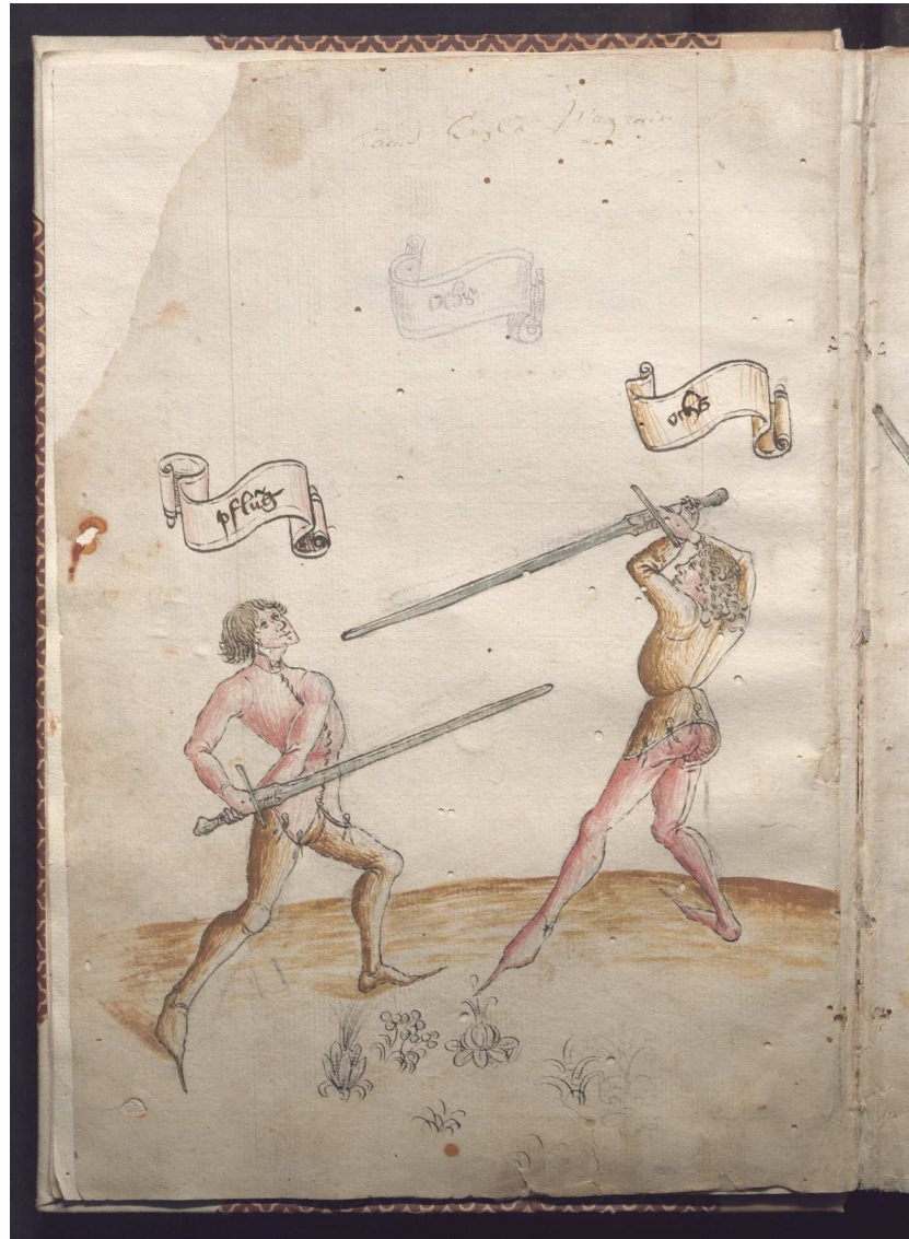
Figure 3. Rome, Bibliotheca dell’Accademia Nazionale dei Lincei e Corsiniana, Cod 44 A 8, fol. 1v: Ochse [the Ox] and Pflug [the Plow]. (Reproduction courtesy of the Bibliotheca dell’Accademia Nazionale dei Lincei e Corsiniana).

Exodus 21 and 22, the pentateuch artist cleverly transformed the unicorn into an ox and thereby forged a linguistic-iconographic connection between the ox and the “Ochs” hunter, both of whom are rendered in red and green with repetitive small stipple marks. Whether the clear awareness of the “Ochs” nomenclature can help determine the precise origin of the manuscript in a German- (or Yiddish-)speaking locale remains to be determined.