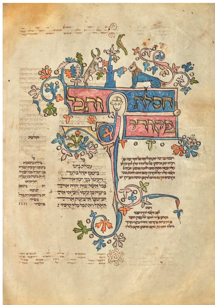
Figure 4. Los Angeles, Getty Museum, MS 116, fol. 220v: VaTeichal [Exodus 39:32–40:38]. (Acquired with the generous support of Jo Carole and Ronald S. Lauder).