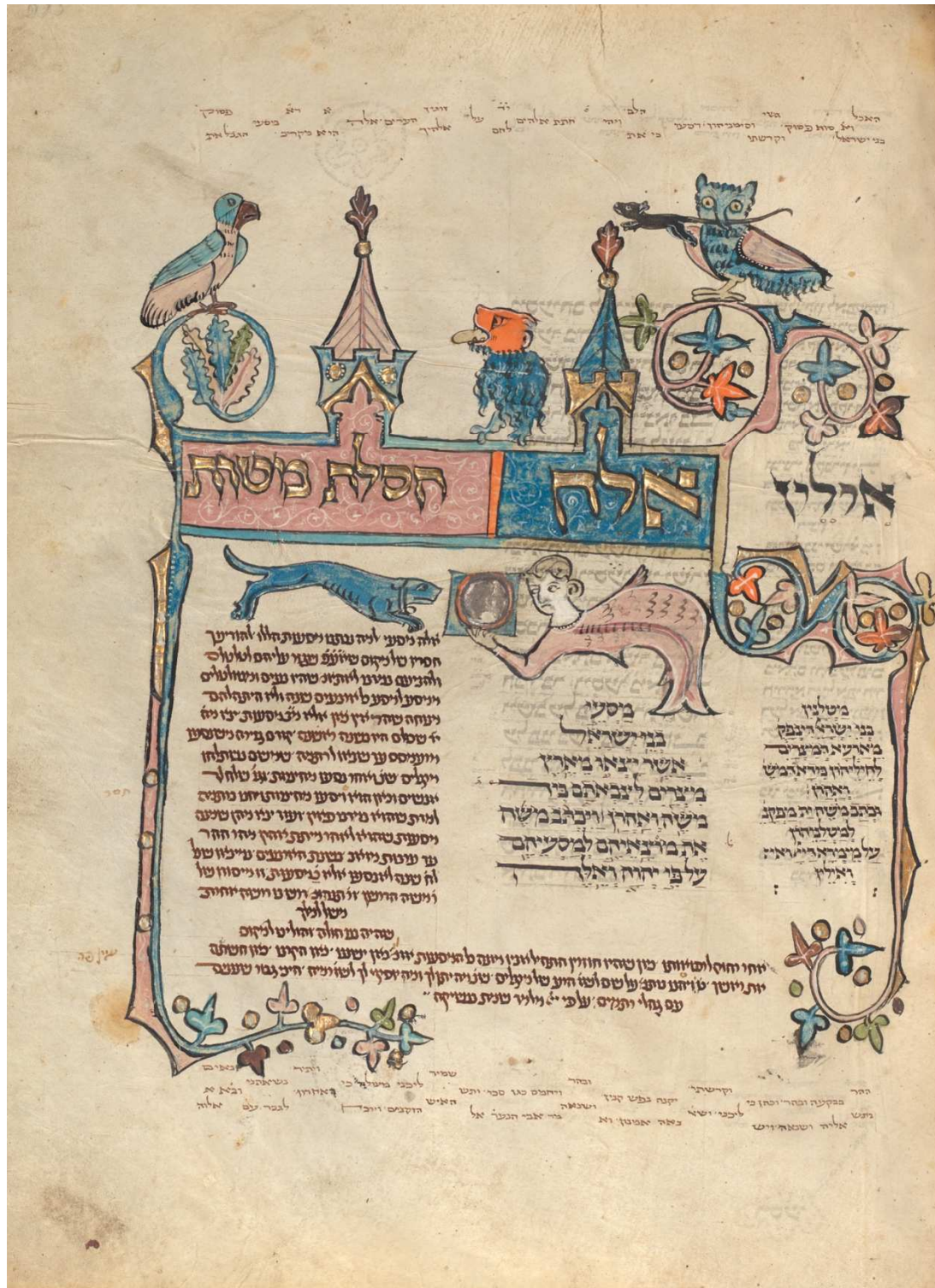
Figure 5. Los Angeles, Getty Museum, MS 116, fol. 393r: Masei [Numbers 33–36:13]. (Acquired with the generous support of Jo Carole and Ronald S. Lauder;).

the siren's song; perhaps the owl is somehow subverting the negative Christian interpretation of the Jews. Both seem like rather forced readings, and it is difficult to relate the owl and mouse pair to the rest of the images on the page or to the Masei text below.